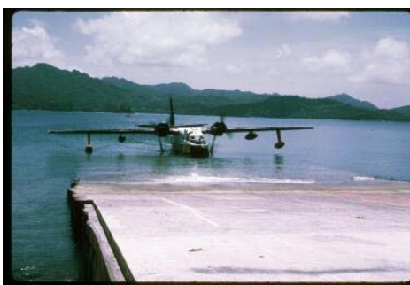
Docking at Chichi Jima

capsule aboard and that wanted it stored and secured for couple of days. His eyes widened and he asked, "Where's bomb?" the With that knew that he didn't know anything about