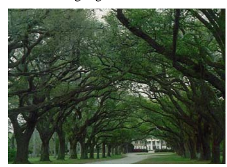
Oaks planted in 1743 line the unpaved drive of the entrance to Boone Hall

One of the highlights of the reunion will