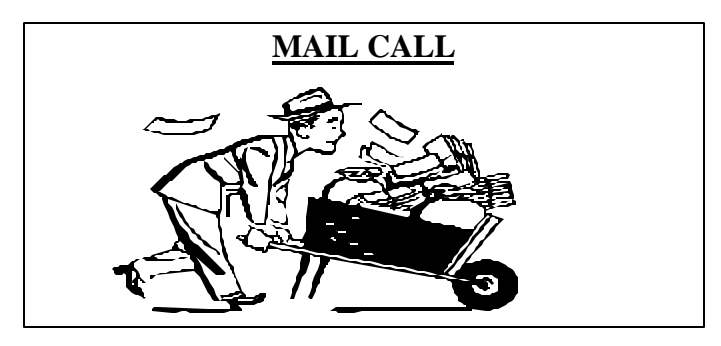
The following letters were received from shipmates seeking information about the USS Ozbourn Association. Some shipmates are also sharing some of their experiences with us.

The wife and I sure missed seeing all of our shipmates at the Charleston 2005 reunion. It was only the second one since 1993 that we were unable to attend.