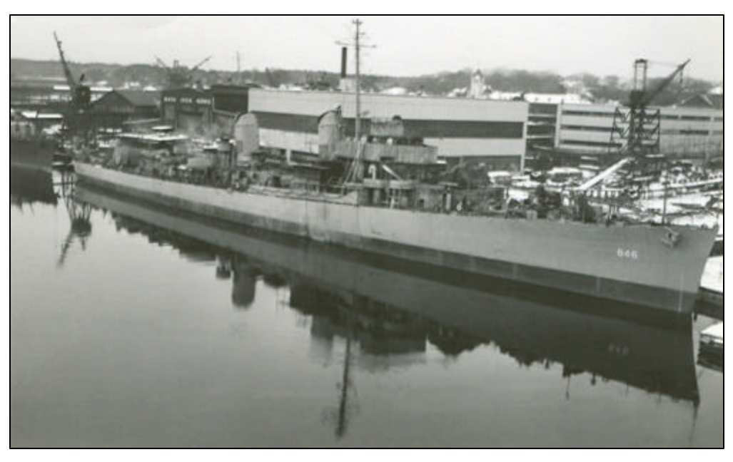
THE FINISHING TOUCHES — This photo, dated 26 February 1946, shows the USS Ozbourn dock-side at the Bath Iron Works, Bath Maine. One week later, the Oz was commissioned during special ceremonies held on Tuesday, March 5, 1946.

IS THAT DOG COMING WITH US? — Shipmates from the pre-communication crew gather around a dog, front row second from left. (Navy Base, Bath Maine, 12 Feb 1946.)