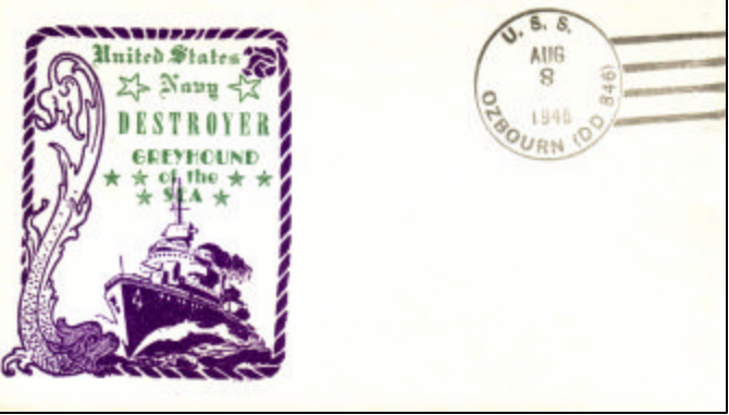
GO, GO GREYHOUNDS — The Ozbourn took part in a fleet-wide promotion of the greyhound navy with this special issue envelope dated August 8, 1946.

remained within easy firing range of the unfriendly islands for the entire operation.