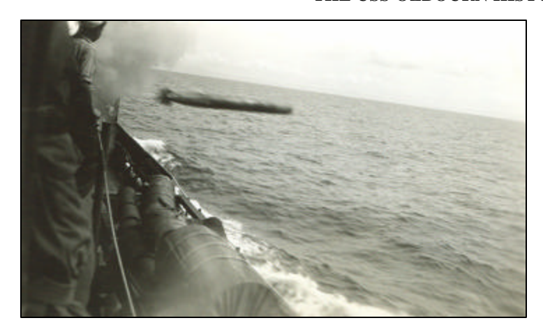
FISH AWAY! — A torpedo is launched from the Ozbourn during a shake-down cruise. The designated target was one of our submarines. Date of photo and location of shake-down exercise not known.