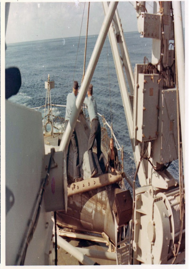
Fireball, Spring 2015