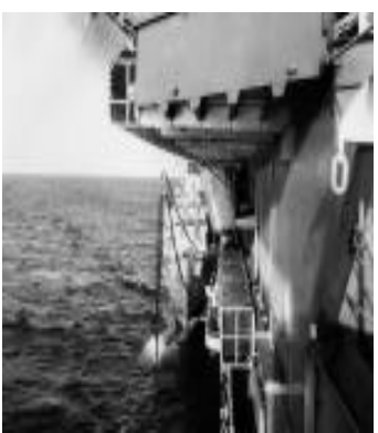
USS Ozbourn (DD 846) brushes against the USS Midway CVA-41 during refueling.