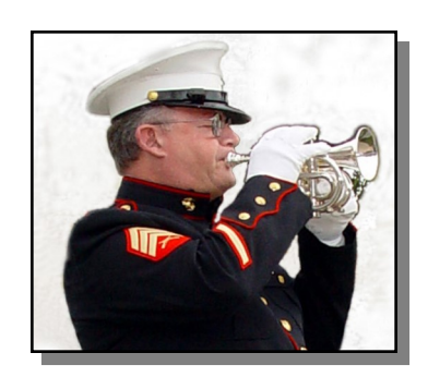
TAPS FOR SHIPMATES