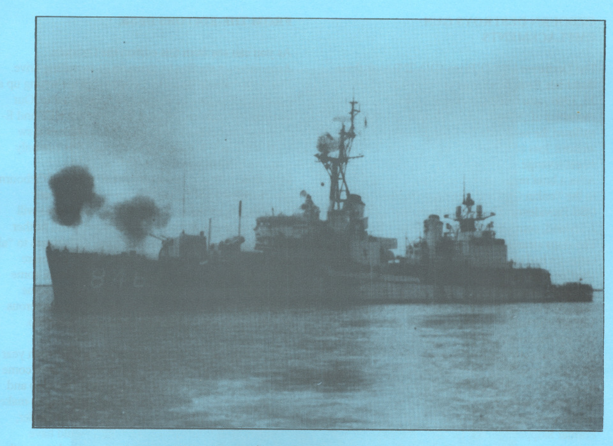
Action Starboard! . . Surface Target!