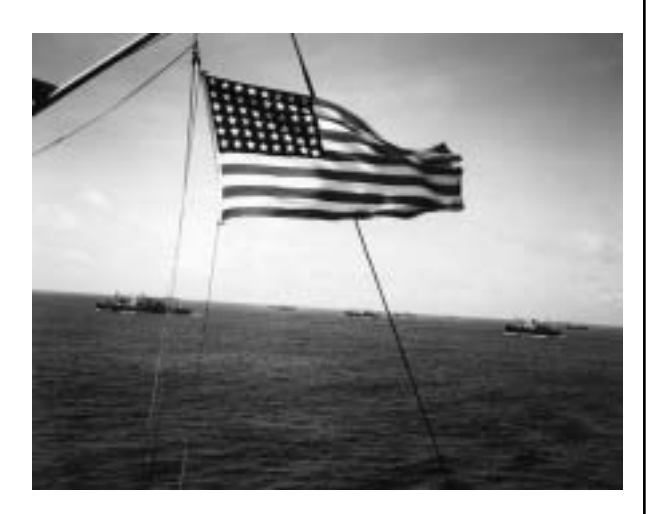
"FIREBALL" The newsletter of the USS Ozbourn Association