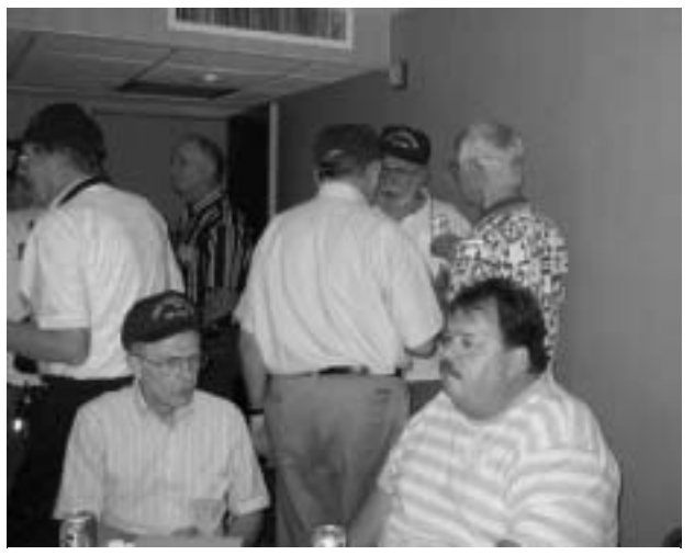
The Sea Stories begin, San Antonio-2003