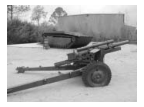
AMTRAC and Howitzer, Marine tools of the trade at the Museum of the Pacific War, Fredericksburg