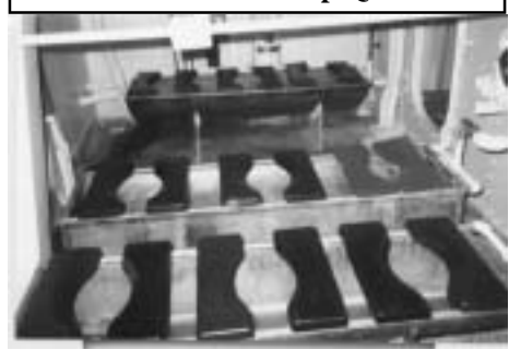
All tin can sailors of the mid-20th. century era should recognize this scene. What is it??? Answer next time.