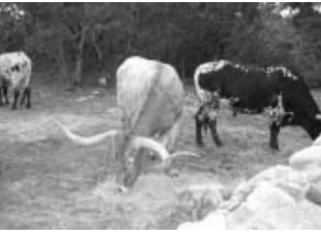
Deep in the heart of Texas!!

hotel and have the old eveglasses fog up. Those of us from the northern climes generally experience reverse phenomenon during the winter time. In any case, the weather did not seem to dampen