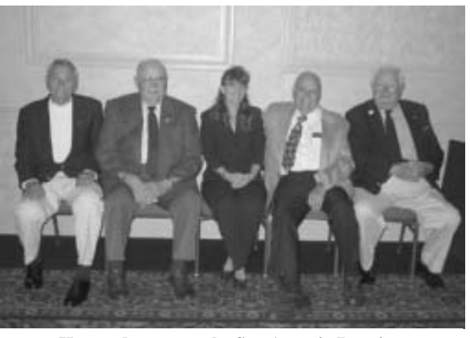
Honored guests at the San Antonio Reunion

The Fourth was overseas for 21 months and was employed solely in the Central Pacific and thus avoided the hazards of the jungle conditions and tropical diseases that were so common in the combat areas further to the south. It was in combat for a total of 63 days and be-