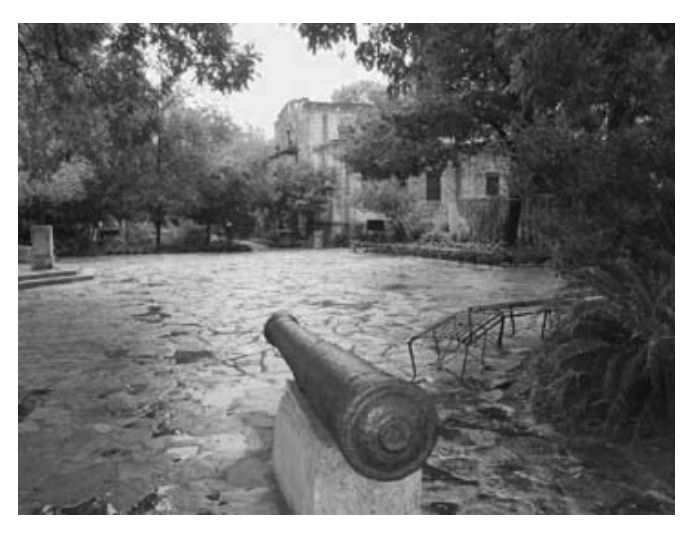
Across the alley from the Alamo!