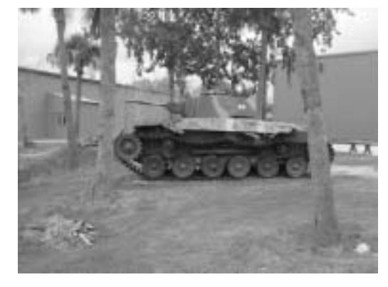
WWII Jap tank on display at the Museum