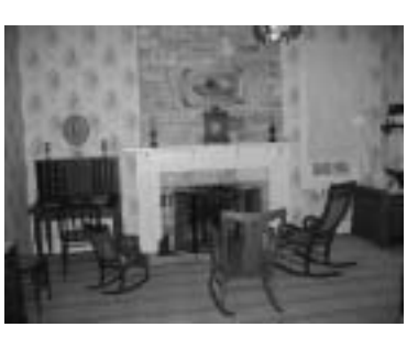
Parlor at LBJ ranch house