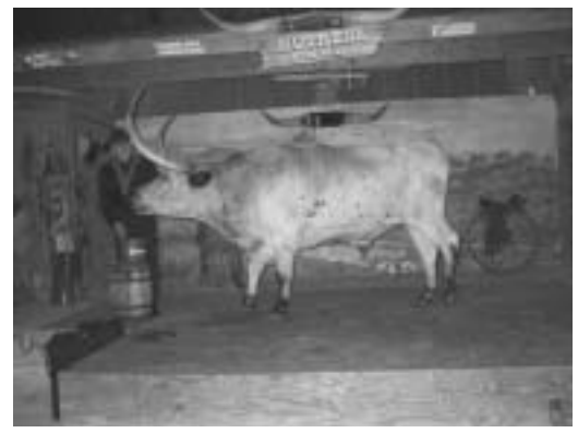
The star of the show at the Diamond W Ranch