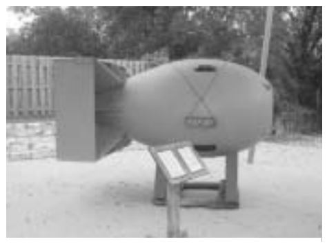
A-Bomb on display- a replica I trust!