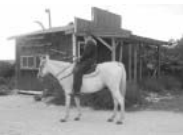
The old wrangler