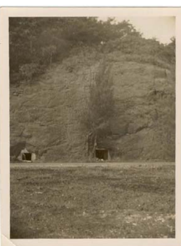
Japanese cave entrances, Chichi Jima

Our first stop was a tunnel about 500 feet long going underground across a small peninsula that was fitted with