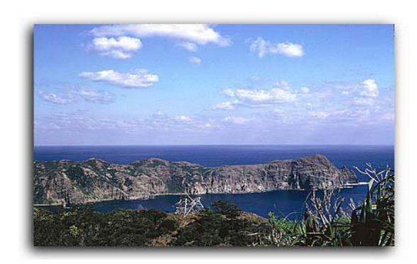
Destroyed mountain top antennas on Chichi Jima

age but a small road was visible despite the overhanging Koa bushes. We walked to a cave entrance, stepping on large snails both dead and alive. The Japanese had introduced both the snails and the Koa from Japan many years before and they had taken over the lush semi-tropical island. With a large flashlight in hand, Bronson led us to a massive steel entry gate, which was open, and we entered the cave. To our surprise, it was a cave within which a massive enclosure much like a Quonset Hut had been built with its walls lined with sheet copper. Looking through a glass porthole much like you would find on a large ship a technician could view temperature and humidity gauges and there were controls to adjust the