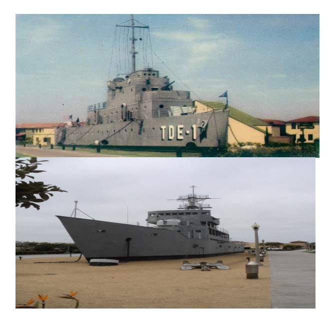
Fireball, Summer 2012

Gedunk Question for Summer 2012 Identify the ships in the photographs and their current location