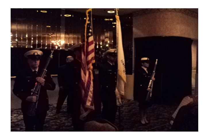
All shipmates and their loyal wives in attendance during the Reunion Banquet were extremely proud of the Honor Guard from USCG STATION PHILADELPHIA.

Over 1,500,000 visitors from around the world visit Our Liberty Bell.