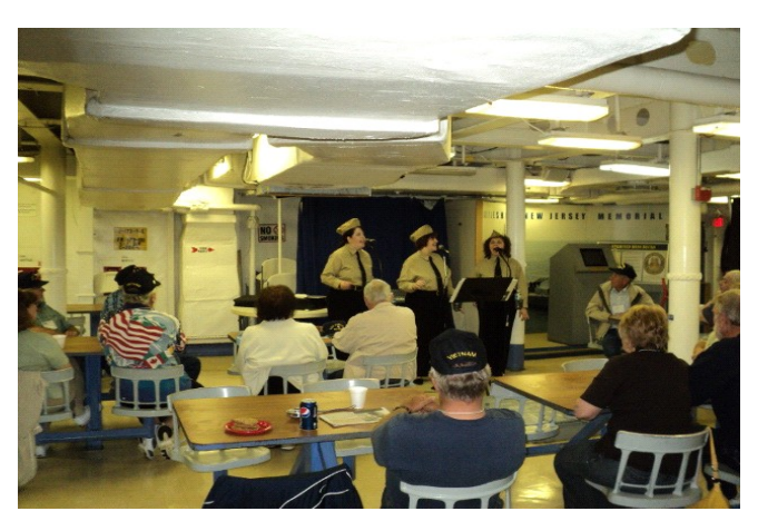
The three sisters providing our USO show were fabulous as well as a great deal of fun.