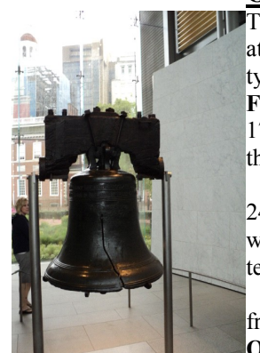
OUR LIBERTY BELL The reunion gave many of the attendees their first opportunity to visit the Liberty Bell.

Facts: When originally cast in 1752 in Whitechapel, England, the bell weighed 2080 pounds.