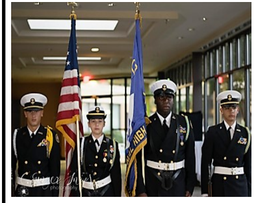
Color Guard, First Colonial & Cox High School Navy Junior ROTC