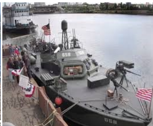
PT 658, Swan Island