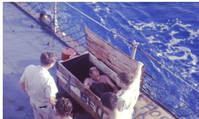
The Commodore Receives Special Treatment