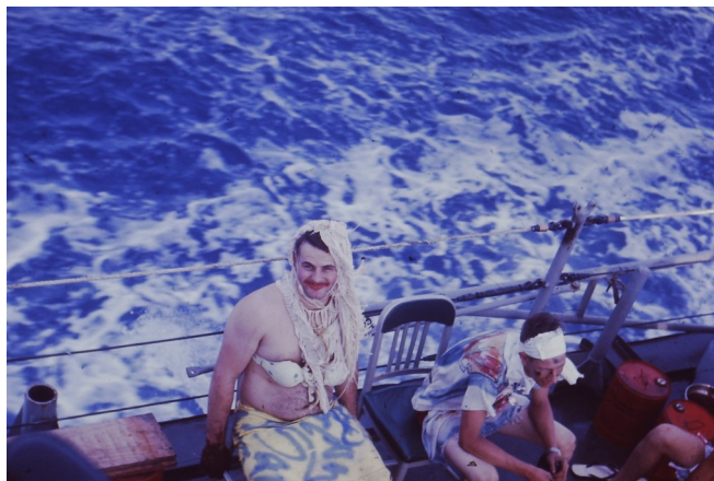
The Royal Court