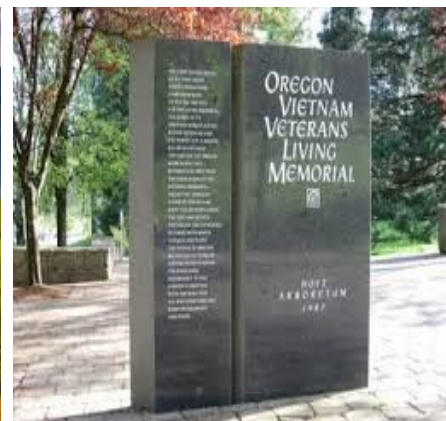
Vietnam Veterans Memorial