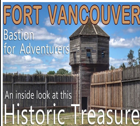
Fort Vancouver, Washington