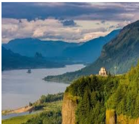
Columbia River Gorge