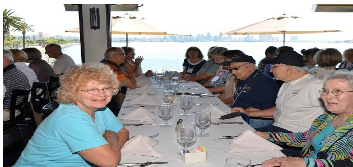
Enjoying a great lunch overlooking San Diego Bay