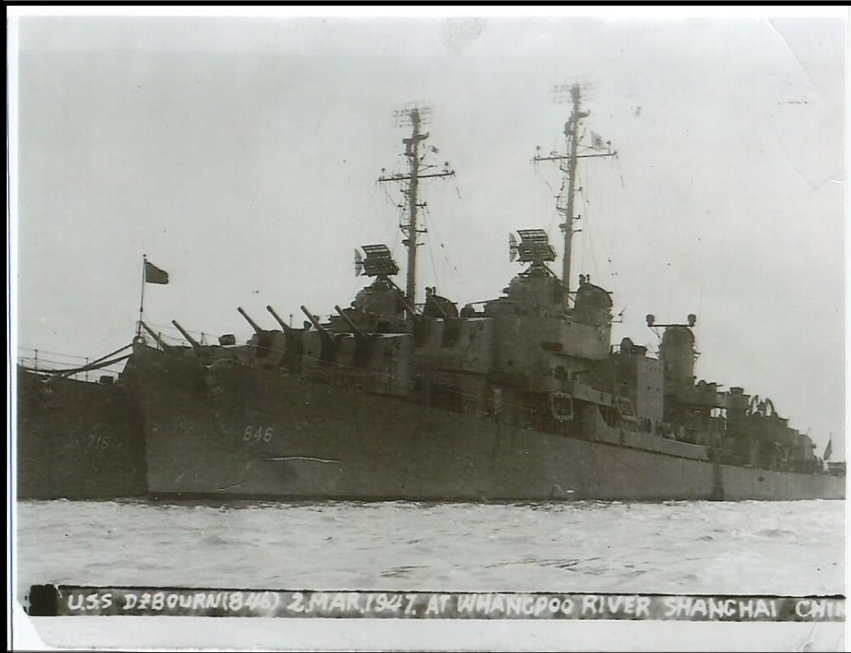
USS Ozbourn DD846 & USS Wiltsie DD716, Shanghai, China